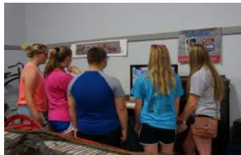
Watching the Peterson Farm Bros Video